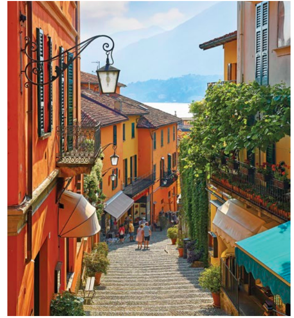
Bellagio, Lake Como