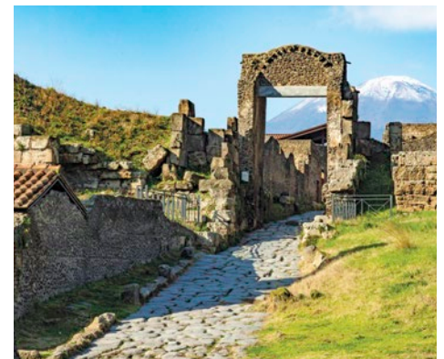
Above left: Amalfi Coast | Above: Pompeii