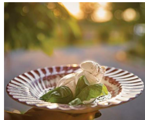
Italian cheese tasting

AHI FlexAir | Our personalized air program features transfers, assistance and flexibility.